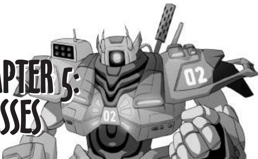
TABLE 5-1: BESM d20 CLASSES